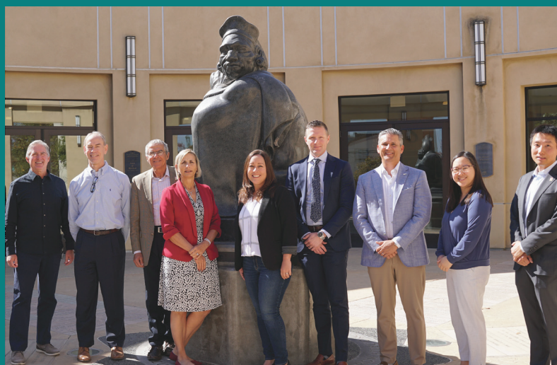
Charles W. Lamden School of Accountancy Advisory Board